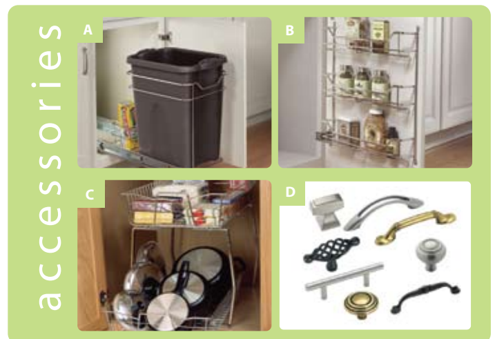
(C) chrome pullouts | (D) hardware